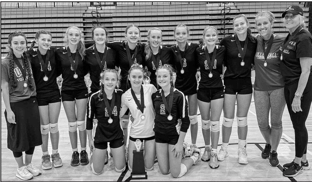
Union County Middle School's volleyball team finished with a 15-3 record (10-2 in league play), highlighted by a NGML championship victory.

Entering the opening match vs. defending league champion Lumpkin County, Miller remained uncertain if the progress in practice would transition over. But once the first ball went into the air on Aug. 5, the rubber met the road, putting