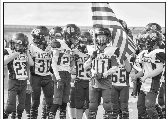
The Union County 4th grade prepares to take the field vs. Fannin County on Saturday, Sept. 21.