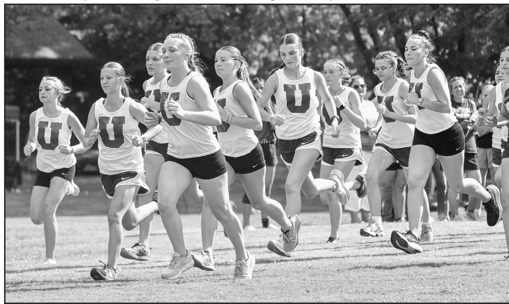
The Union County ladies leave the starting line during an early-season race.

in seventh (225), Lafayette was eighth (244), Gordon Lee ended up ninth (256) and Coahulla Creek placed 10th (267).