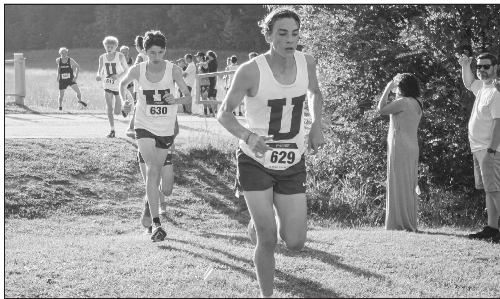
The Union County men bunch together at last month's Stephens County race.

Behind Union and Coahulla Creek, Region 7-AA teams included Sonoraville in 11th (329), North Murray in 14th (369) and Murray County