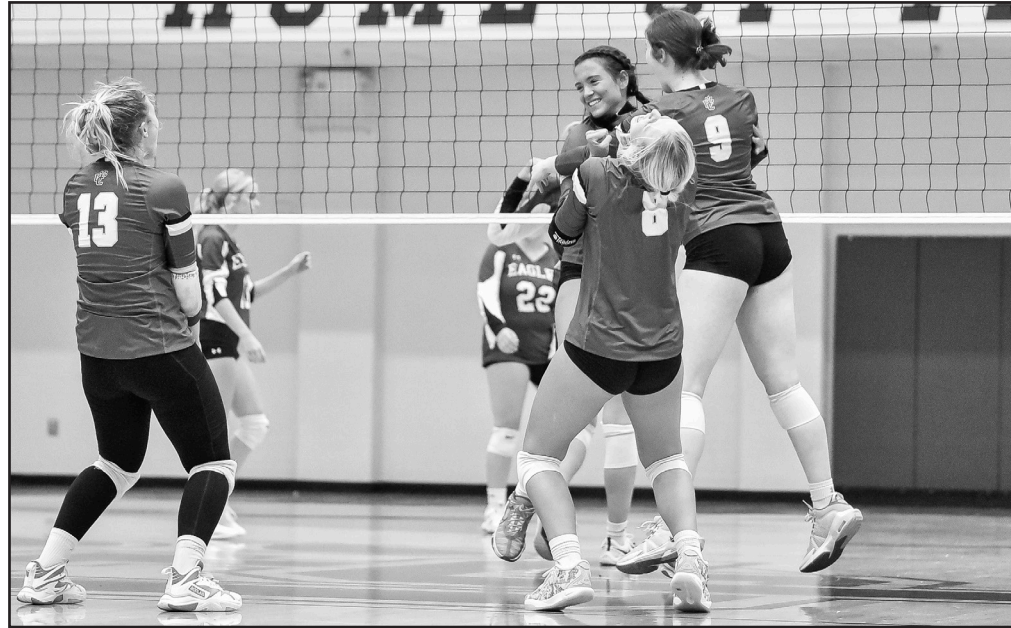
Union County volleyball got back on track with two wins last week.